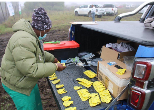
An official preparing tags to be used on the day.