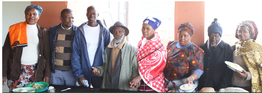
Farmers of Sterkspruit enjoyed farmer capacity-building workshop and traditional seed and fair event in Sterkspruit.