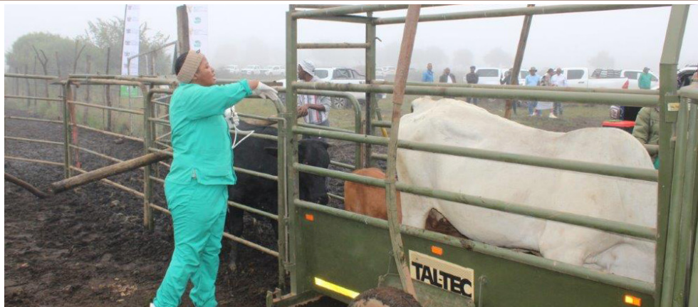
Preparations before vaccination took place.