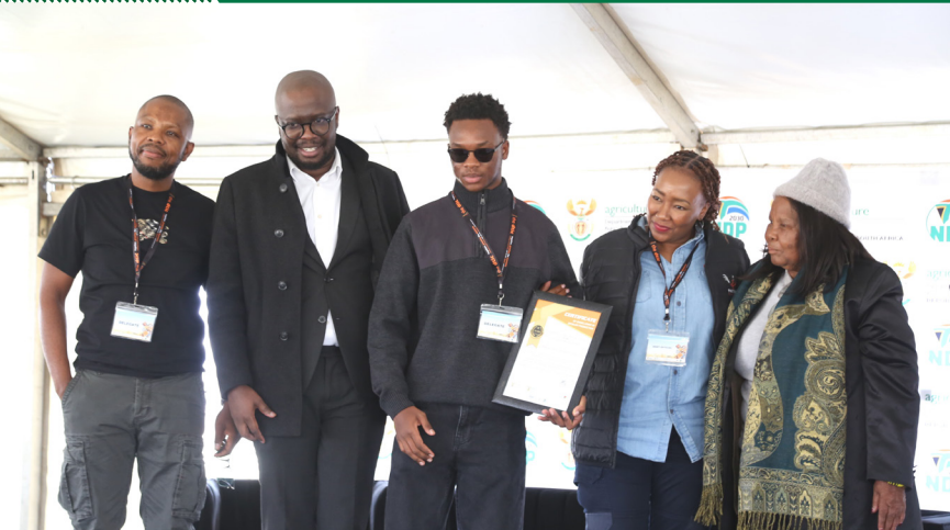
Phetogo Grootspuit Broiler Farm in Bronkhorstspuit received a recognition certificate from Department of Agriculture and Department Trade, Industry and Competition.