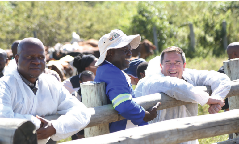
From left: Eswatini Minister of Agriculture Mandla Tshawuka, a livestock farmer from Shabalala Village and Minister John Steenhuisen, during the FMD mass vaccination in Hazyview.

to improve coordinated responses against FMD and other transboundary animal diseases affecting the region. Our drive now is to get a regional approach to FMD. Part of the success of what we learned from our trip to South America was that you only beat FMD if you adopt a regional approach to this," he said.