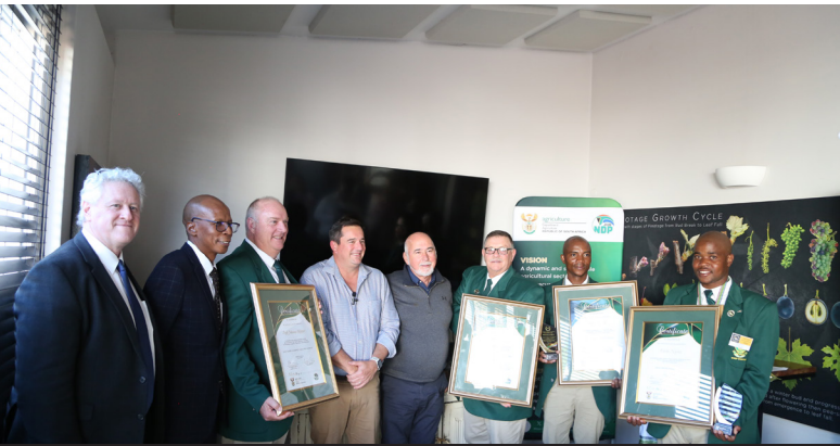
Minister John Steenhuisen honoured world class performers in the wool industry.