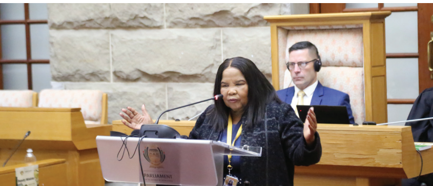
Deputy Minister Nokuzola Capa during the department's Budget Vote in Parliament.