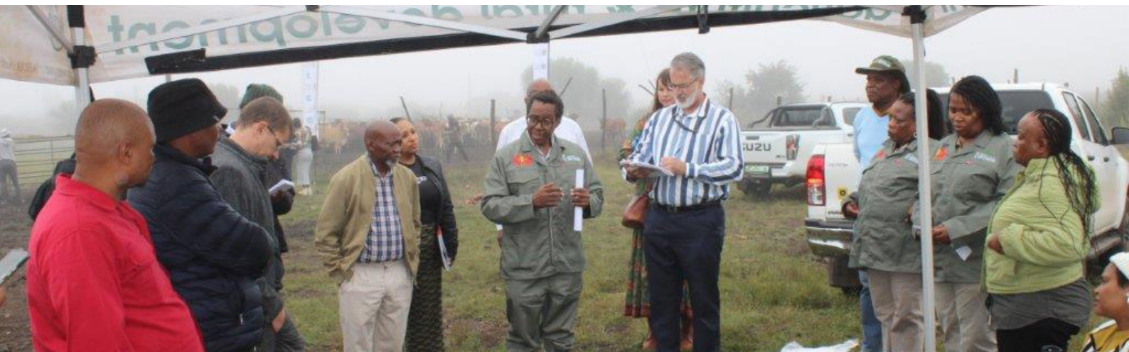
A meeting held between officials and committee members before vaccination commenced.

The constant supply of Turkey's Dollvet and Argentina's Biogénesis Bagó FMD vaccines and the ARC's vaccines is set to increase supply to provinces and intensify the fight against FMD. At the time of publishing this article, eight million FMD vaccines had been received since January 2026 and delivery of an additional seven million vaccines from Turkey and Argentina was anticipated in May and June 2026.