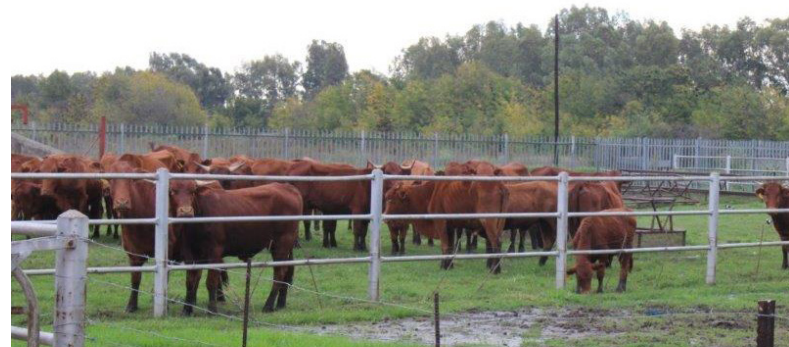
Cattle at Potchefstroom College of Agriculture.

He further said there have been workshops at national level, but the committee has not had a chance to visit at provincial or local level, so this is the first visit to gauge whether the support that National Office said they are going to roll out to provinces and municipalities is taking place.