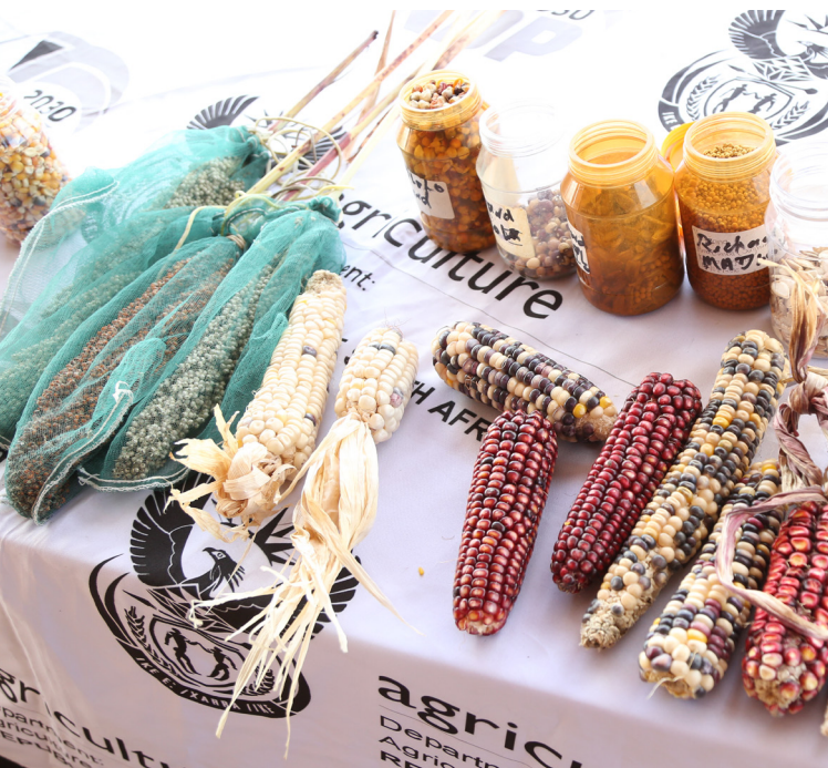
Some of the important traditional seeds.