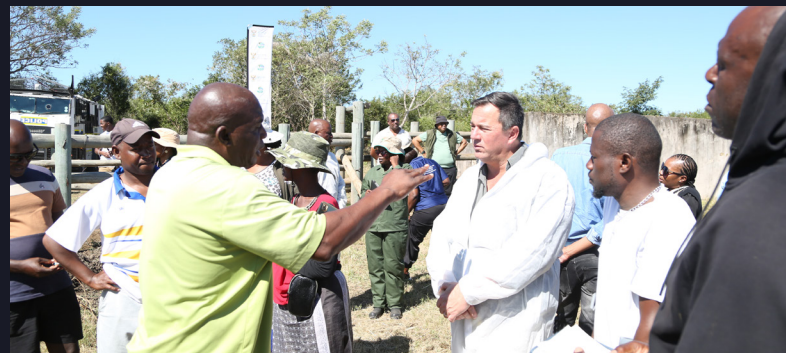
Minister John Steenhuisen engaging with farmers during the Mpumalanga FMD vaccination drive.