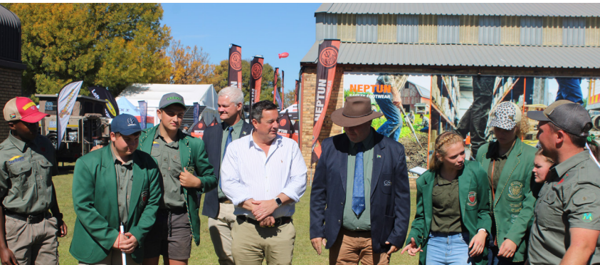
Young visitors explore the future of farming at NAMPO Harvest Day 2026.