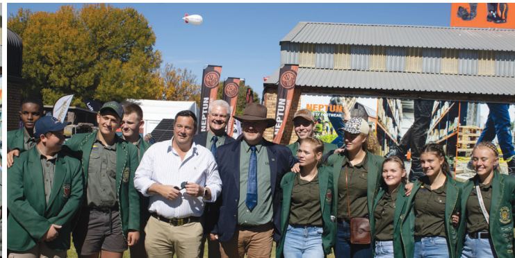
Representatives from Grain SA and Minister Steenhuisen, and young learners engage on the future of agriculture.