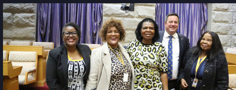
Members of Parliament and the leadership of the Department of Agriculture during the Budget Vote 29 in Parliament.